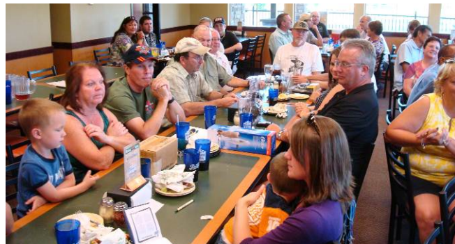
Competitors and families enjoying the 2011 awards banquet