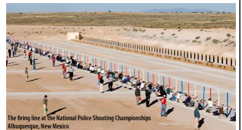
The firing line at the National Police Shooting Championships Albuquerque, New Mexico